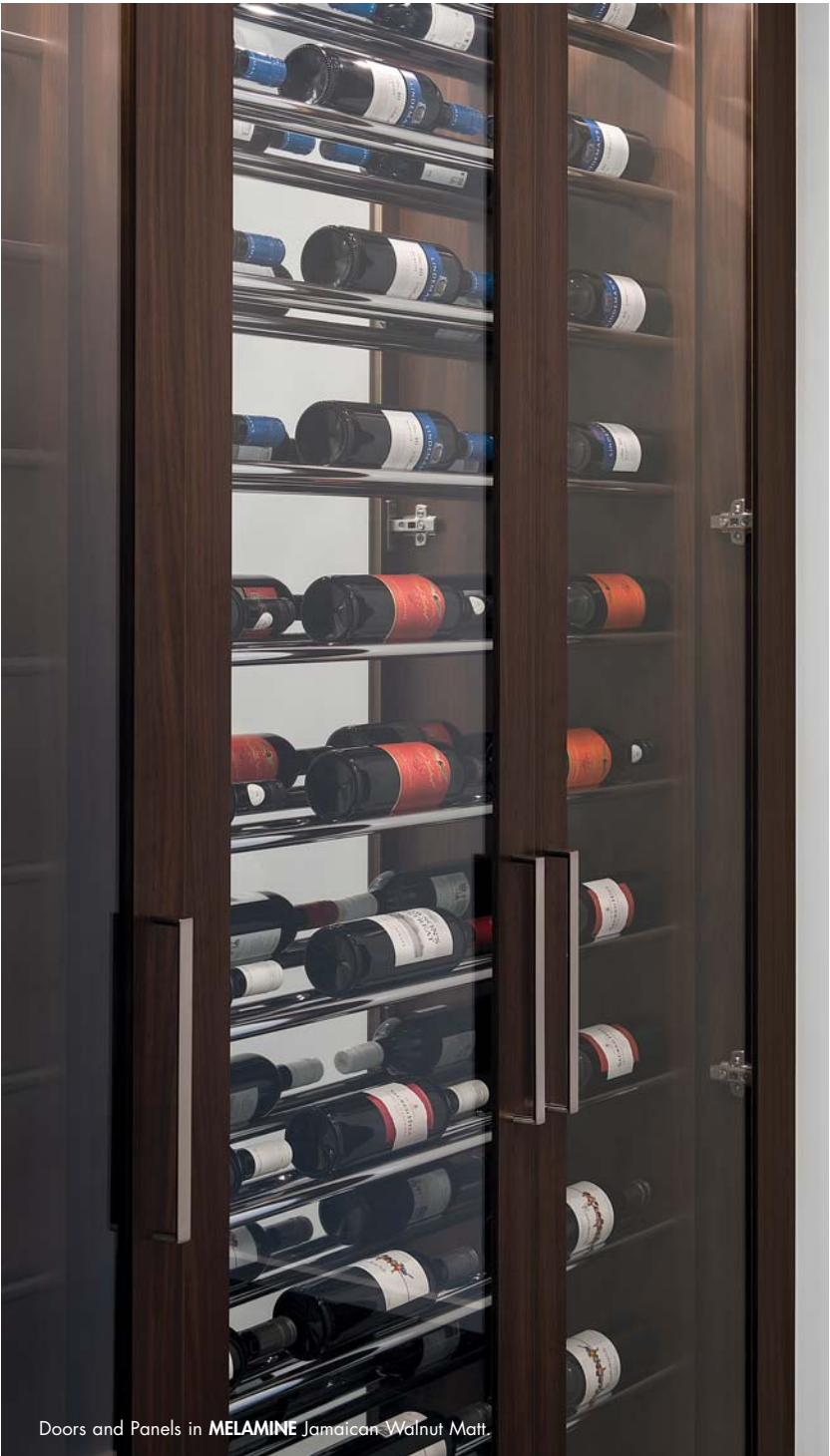
Doors and Panels in MELAMINE Jamaican Walnut Matt.