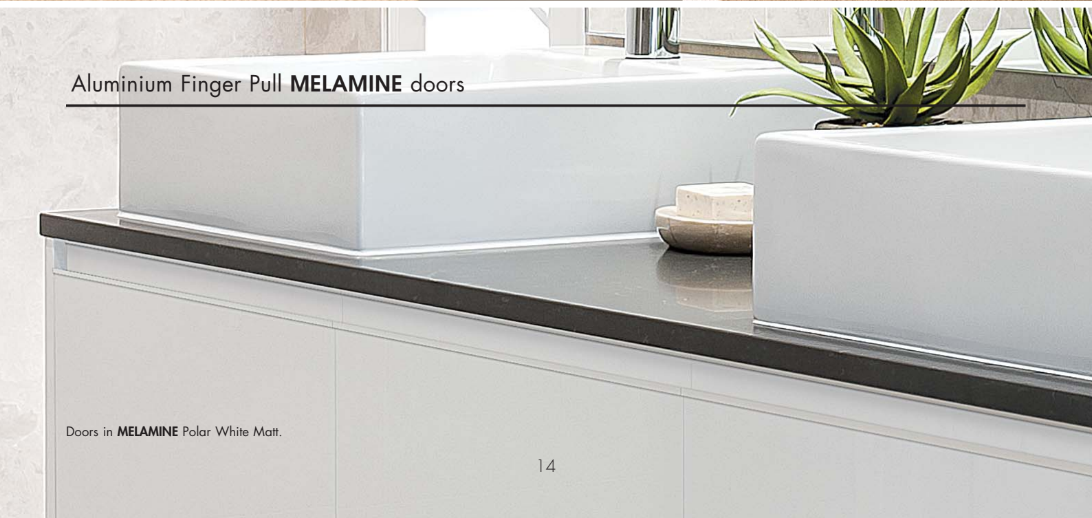
Doors in MELAMINE Polar White Matt.