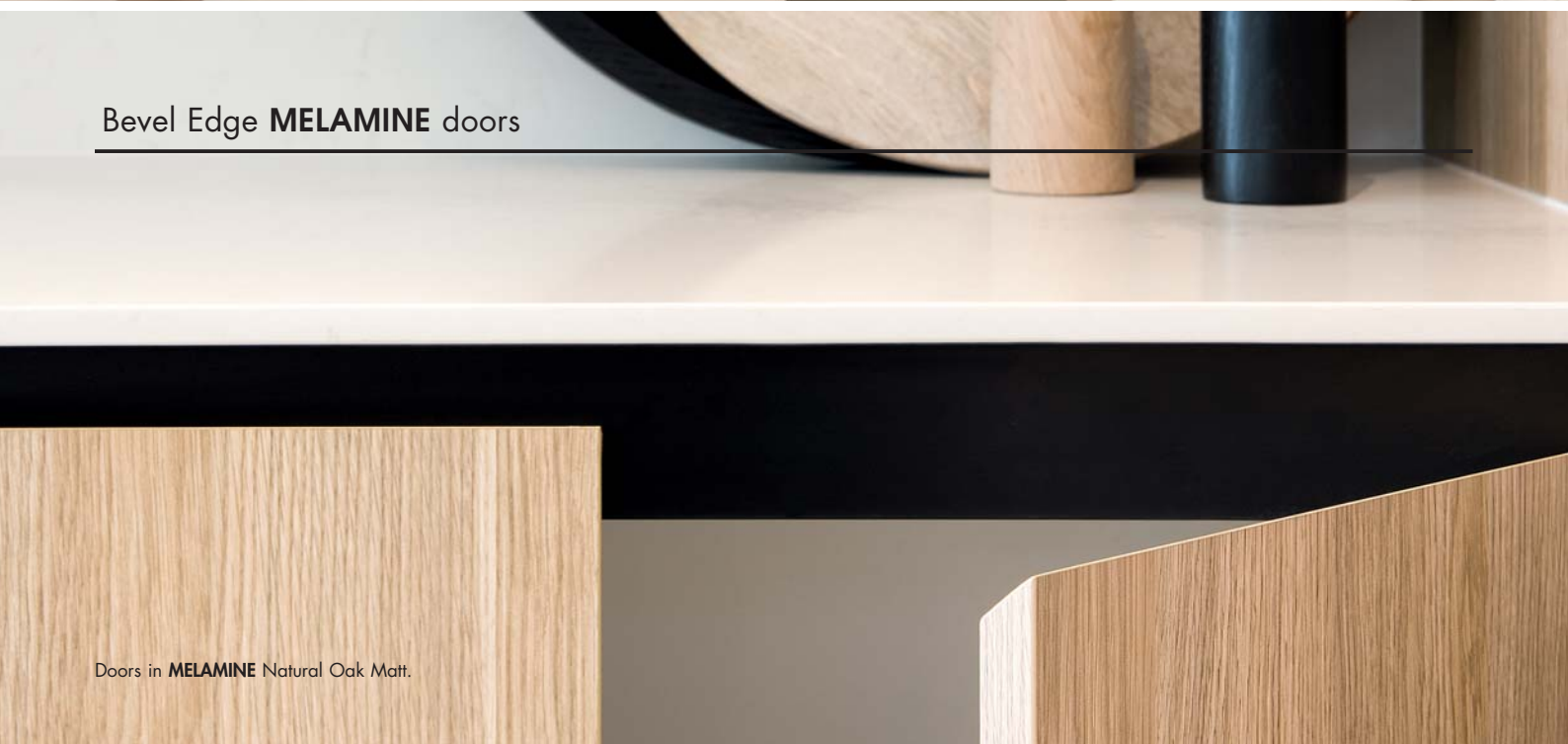
Doors in MELAMINE Natural Oak Matt.