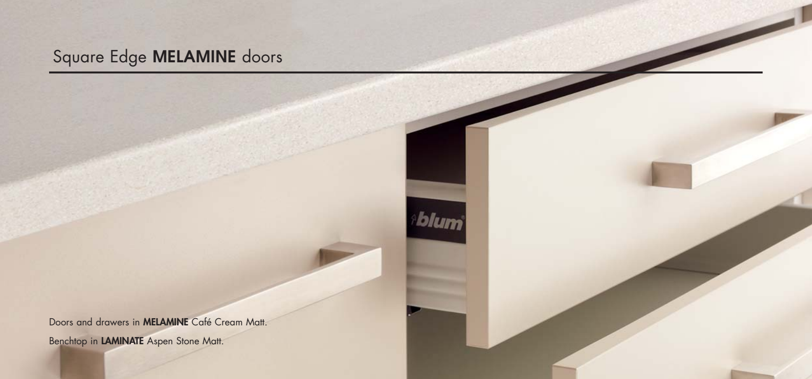
Doors and drawers in MELAMINE Café Cream Matt. Benchtop in LAMINATE Aspen Stone Matt.